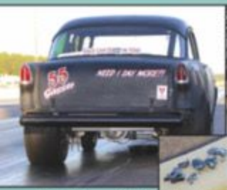
Parts & pieces. You don't have to say more.