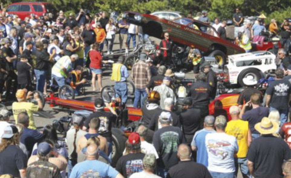
A great overhead shot of the cackle fest. A reminder of how the pit area looked in the early days of Drag Racing.