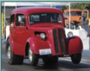
Whitey Hurst's '48 Anglia A/Gasser