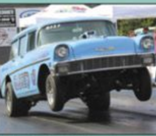
Craig Ziegler's '56 Wagon, "Gassed Up"