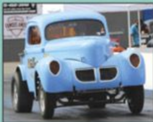
Dan Lau's 1940 Willys Pickup