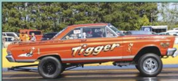
Bill Killough's 1963 LeMans blown Gasser