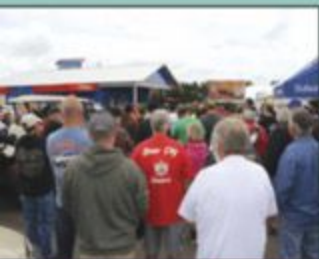
A packed Drivers' Meeting