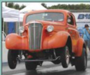
Ed Rolaro's 1937 Famoso Speed Shop Chevy