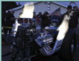
Several Fuel Dragsters fired their Nitro Burning Hemi Engines to the delight of the cheering crowd