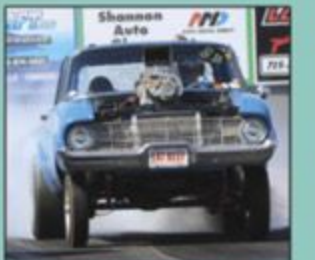
Devin Dark's GCS Falcon