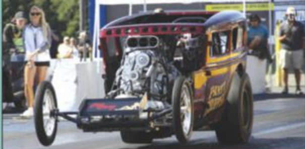
Wheels up for Patrick Hampton's Competition Coupe "Panty Dropper"